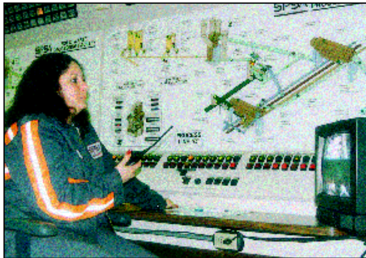
The RDF Plant processes solid waste into fuel at the rate of about 120 tons per hour. Employees in the plant and cameras in the control room screen the waste for hazardous materials or bulky items which could impede the processing.