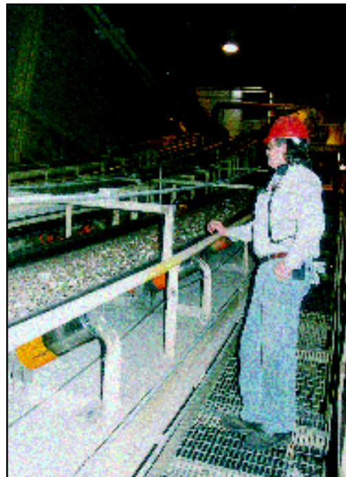
As solid waste moves through the RDF Plant on a system of conveyor belts, continuous checks of the material and equipment are conducted to ensure smooth plant operations.

the waste stream at the RDF Plant to be recycled. An average of 1.5 million pounds of aluminum is recovered from the waste stream each year. A household hazardous waste collection facility is operated at the RDF Plant site to ensure the proper disposal of items such as pesticides, automotive products, household cleaners, and paint products. Also, SPSA allows residents to dispose of up to five gallons of used motor oil per visit to a collection site. These free services are offered to provide residents with the opportunity to properly dispose of potentially harmful household products, to reduce the risk of hazardous waste entering the waste stream, and to help protect surface and groundwater supplies.