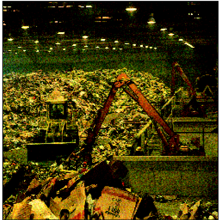
Waste is unloaded on the RDF Plant's 1.3 acre tipping floor where burnable material is separated from the nonburnable. The burnable waste is processed into fuel, and the remaining waste is loaded into SPSA vehicles to be delivered to the Regional Landfill in Suffolk.

In addition to the belts which transport refuse derived fuel, three conveyor belts transport nonburnable waste out of the plant to open-top trailers. One line carries ferrous materials, the second transports reject materials to be landfilled, and the third conveyor line can be used for either.