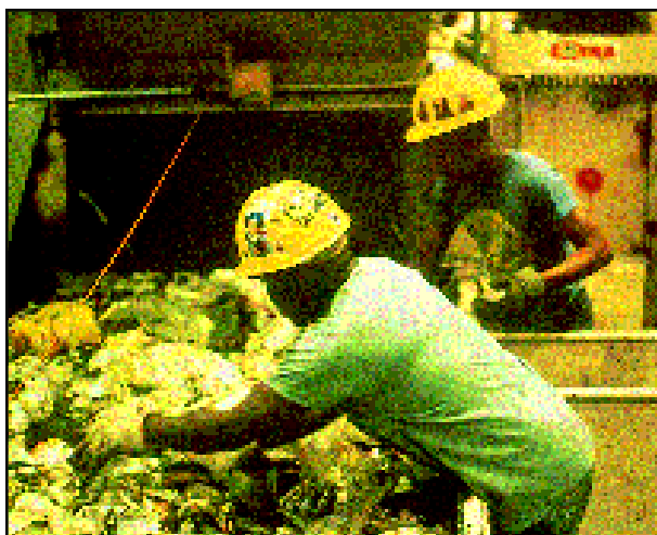
As solid waste is processed into fuel, employees hand-pick about 75 tons of aluminum monthly. This material is sold for recycling.

The RDF Plant serves as the location for several other SPSA operations. In addition to producing refuse derived fuel, aluminum is removed from